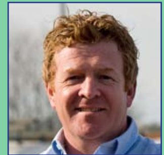
A Highland Cow